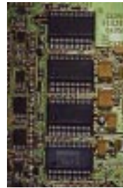
192kHz/24-Bit Audio DAC and 96kHz/24-Bit Audio DACs